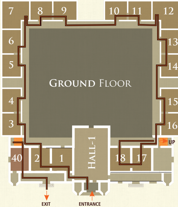
Path of movement