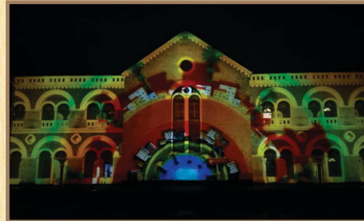
3D Projection Mapping Show